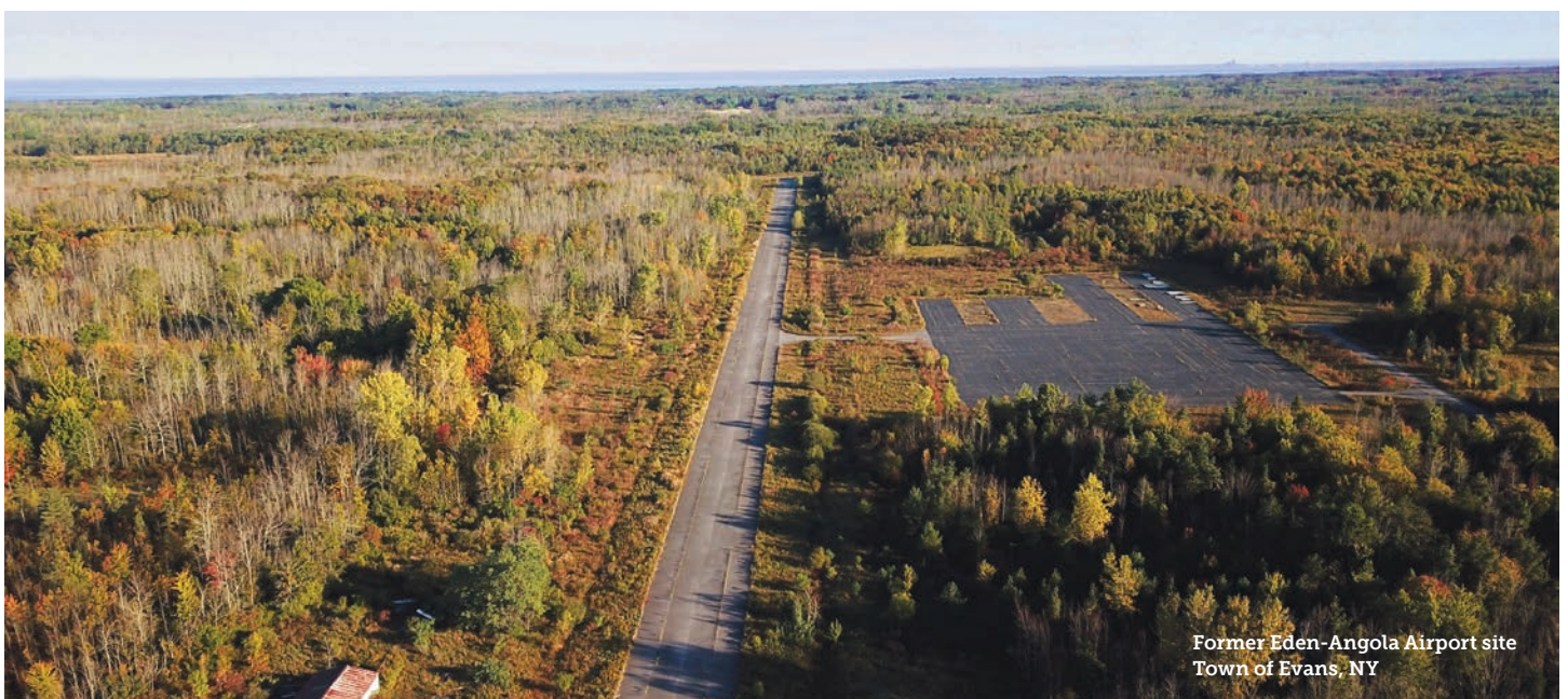
Former Eden-Angola Airport site Town of Evans, NY

The ILDC and Erie County purchased the former Eden-Angola Airport property ( pictured below ) from a private owner in 2020. Located in the Town of Evans, the 240-acre site will be redeveloped into an agri-business park. The ILDC is currently working with designers on an infrastructure Master Plan, with initial remediation and infrastructure development slated to begin in the spring of 2021.