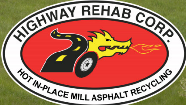
Highway Rehab fleet • Photo courtesy of Highway Rehab Corporation