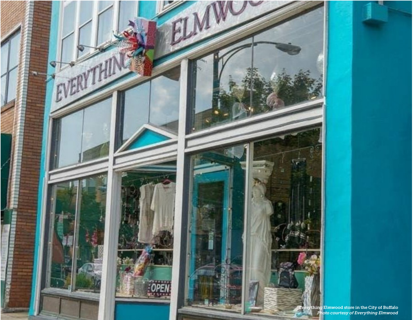
Everything Elmwood store in the City of Buffalo

The Regional Development Corporation (RDC) is the lending arm of the ECIDA. Funded by federal grants, the RDC was created in 1979 to administer low-interest business loans to higher risk businesses in Erie County. The funds are restricted by federal regulations, including a qualification requirement that businesses must first be turned down by a traditional lending institution. These regulations were relaxed in 2020, to accommodate more businesses affected by COVID-19.